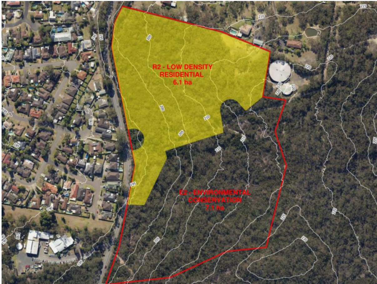
Figure 2 – Proposed R2 – Low Density Residential Extent

Figure 2 below illustrates the extent of the proposed residential rezoning. The residual site area, approximately 7.1ha being the southern portion of lot 512, is to be maintained as bushland under the existing E2 – Environmental Conservation zoning.