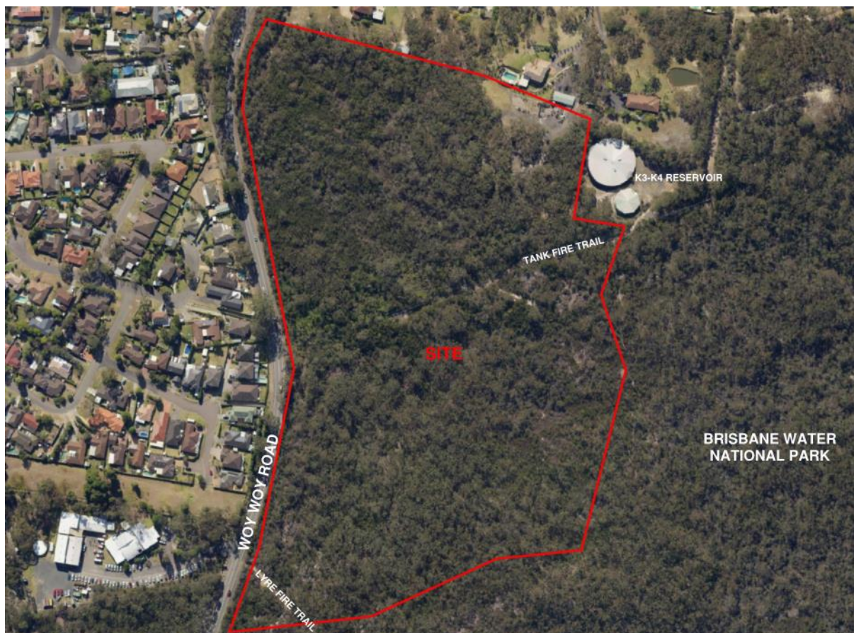
Figure 1 – Existing Site

Located within the Central Coast suburb of Kariong the site is irregular in shape and has a total area of approximately 13.2ha. Shown in Figure 1 , the site is bordered by Woy Woy Road to the west, existing rural residential properties to the north and bushland within the Brisbane Water National Park to the south east. Notably, the Kariong K3 - K4 reservoir neighbours the site's north eastern corner.